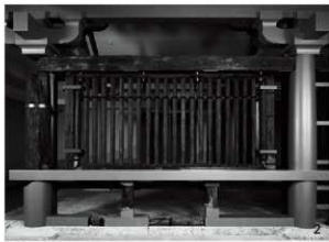
2: 東回廊の復元展示 The reconstruction of the eastern corridor with the excavated wood

Construction of this large temple was begun in 641 (the 13th year of Emperor Jomei's reign) by Soga-no-Kurayamada Ishikawamaro, a cousin of Soga-no-Iruka. It was one of the clan temples the construction of which was then in vogue among the various wealthy families of the time. Although Ishikawamaro participated in the Isshi Incident (which involved the murder of his cousin Iruka) and was subsequently appointed Minister of the Right, In 649 he came under suspicion for allegedly plotting rebellion. The same year he committed suicide in the still unfinished clan temple. He was posthumously absolved of the earlier suspicions, and the building of the Yamadadera was continued with help from the imperial house and completed in the latter half of the 7th century. The Yamadadera had a ground plan with gate, pagoda, golden hall and lecture hall arranged in a line from south to north, respectively. In 1982 collapsed structure of eastern corridor, which had been sealed under clay layer, was excavated.