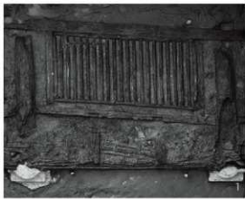
1: 東回廊の発掘 Remains of the eastern corridor after excavation

発掘調査で中門・塔・金堂・講堂を南から北へならべ、回廊が塔・金堂を囲むという伽藍配置が明らかになり、金銅の風招や、磚仏・鵝尾・鬼瓦・瓦などがみつかった。また、1982年からの調査では倒れた東回廊の建物に土に埋もれた状態で残っていることがわかり、古代建築の貴重な資料となっている。