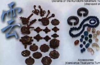
Accessories [Kami-enya Tsukiyama Tumulus]