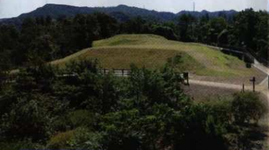
Nishidani Tumuli Ruins Park