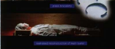
real-sized reconstruction of man's burial