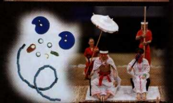
Boards of glass and paper [Nishidani No.3 Tumulus]