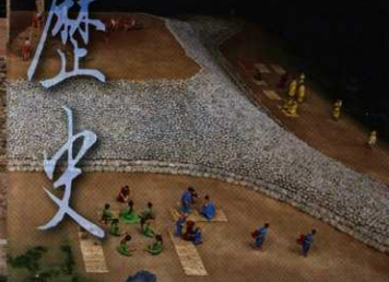
diorama of Nishidani No.3 Tumulus on a scale of 1/10