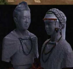
Restored accessories of the King and Queen