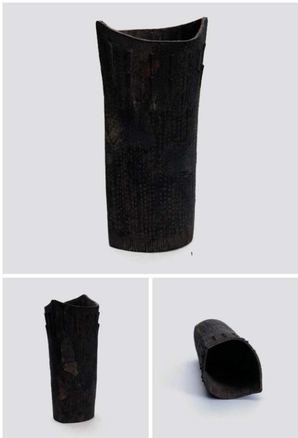
图版 8 3号竖穴住居跡内土器①