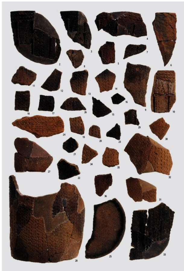
図版 9 3号竪穴住居跡内土器②