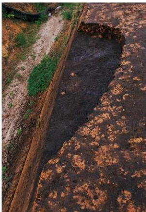
4号竪穴住居跡 完掘 北から