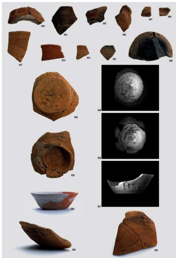
図版98 南部の土器 7 (墨書土器, 線刻土器)