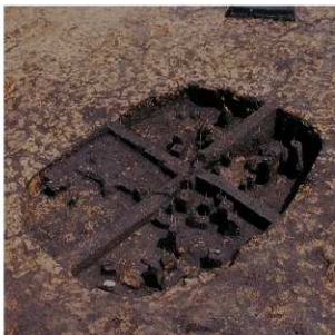
左上 3号竪穴住居跡 検出 西から 右上 埋土中遺物出土 状況 南西から