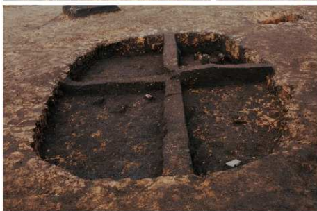
3号竪穴住居跡 埋土堆積状況 西から