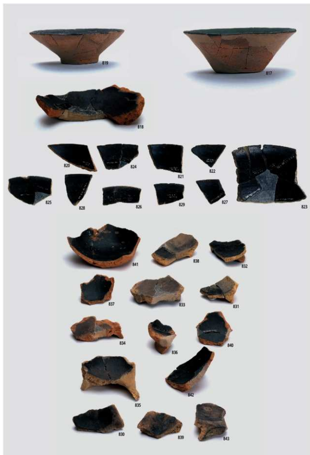
図版97 南部の土器 6 (内黒土師器)