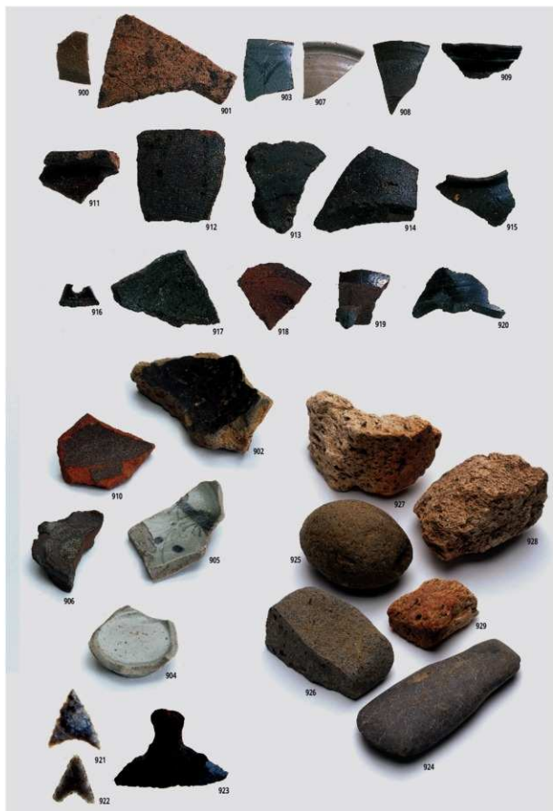
図版100 南部の土器 9 (陶磁器), 石器