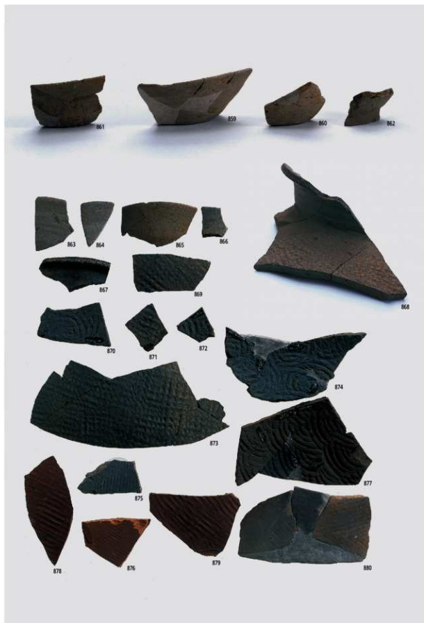
図版99 南部の土器 8 (須恵器)