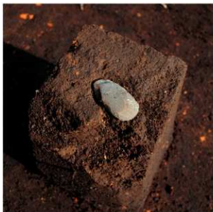
左上 小型磨製石斧 出土状況