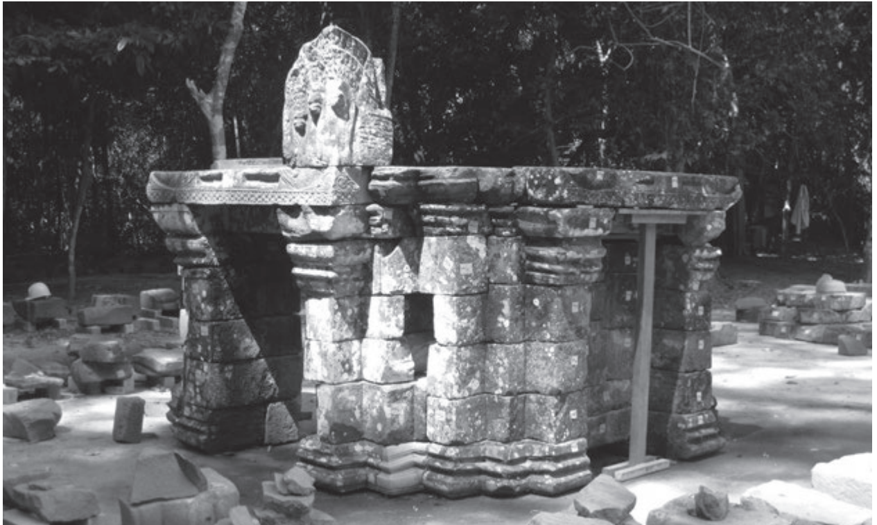
Fig. 73: Trial assembly of the framework (viewed from the northeast)

Trial assembly of the lower platform was commenced in the beginning of FY2014, and is currently ongoing.