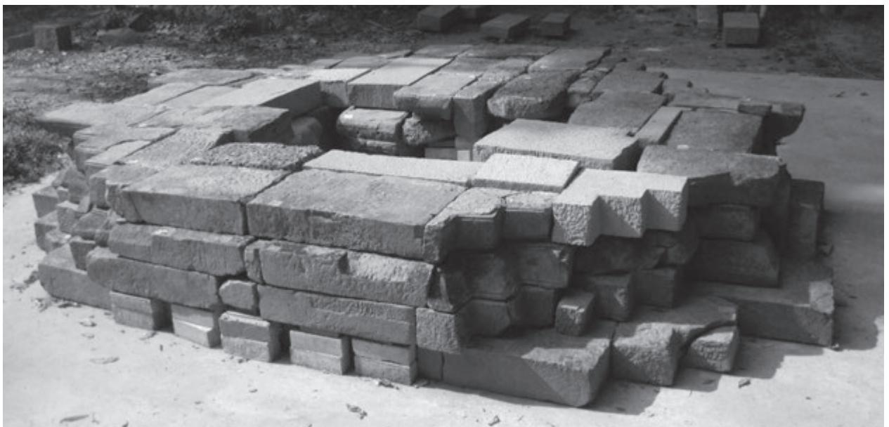
Fig. 74: Trial assembly of the upper foundation (viewed from the northwest)