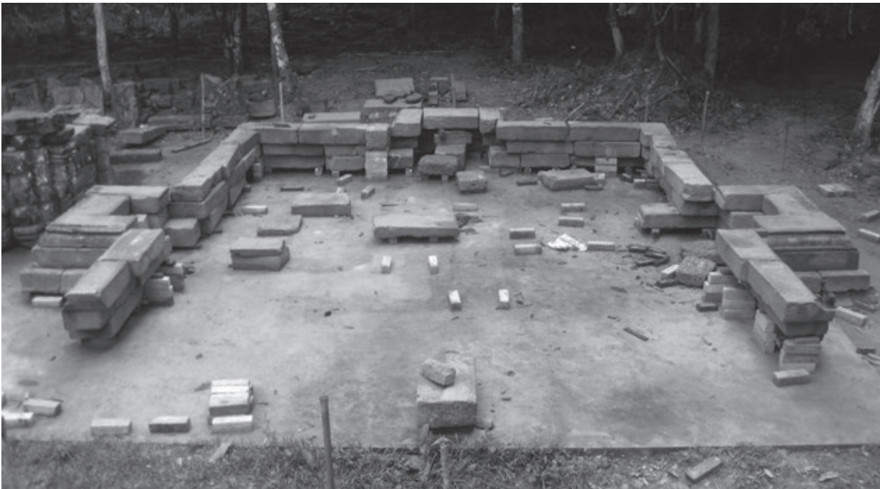
Fig. 75: Trial assembly of the lower platform (viewed from the west; June 10, 2014)